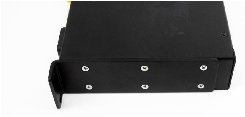
Reversed, rear mount rack bracket position