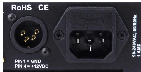
DC Input on 4 Pin XLR, AC Input

This unit can be powered from AC Line Voltage (90 to 240Vac) or from low voltage DC such as rechargeable batteries, DC power supplies or other sources. The DC input has a voltage range of 10 to 18Vdc. The unit draws approximately 800mA of current @ 12Vdc with no active antennas powered up. When operated with the maximum of eight (8) active, powered antennas, the unit will draw approximately 2 Amps @12Vdc.