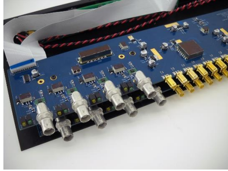
PSC Custom made 4-Layer RF Circuit Boards