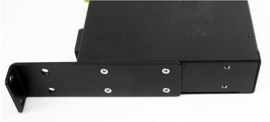
Reversed (rear mount) position and offset mounting for added cable and connector clearance