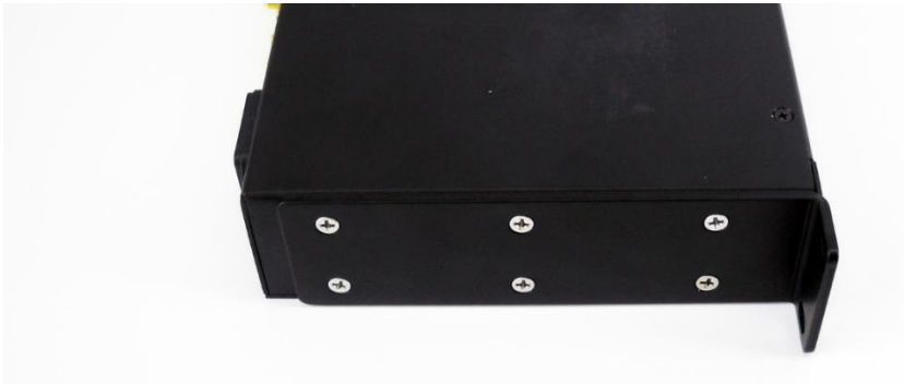
Normal, front mount rack bracket position