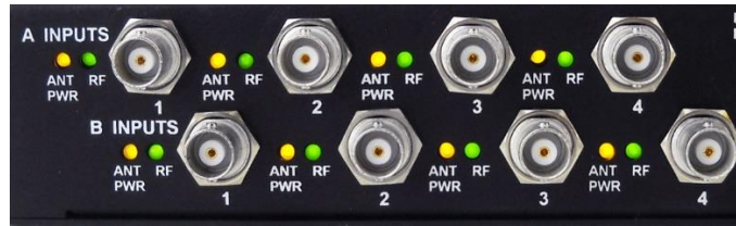
RF Inputs showing LEDs which Indicated which BNCs are active (RF Assigned) and which BNCs have Remote Antenna Power applied.

the rear panel of the unit located right next to each RF input BNC connector for your convenience.