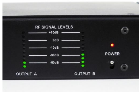
RF Signal Level Meters

There are two RF signal level meters on the front panel of the PSC Active RF Matrix. These meters monitor the RF signal strength of the RF that is going out of the unit via the SMA connectors to your wireless receivers. They display signal levels from approximately -56dB up to +10dB. They can be used for overall RF signal monitoring while in normal use or for RF signal level monitoring while doing site setups. For example, if you want to test the RF signal strength of your various RF Zones before production starts for the day, you can switch on only that one particular RF zone and then use the meters to monitor that one RF zone. You can repeat this quick test for any and all other used zones, one zone at a time.